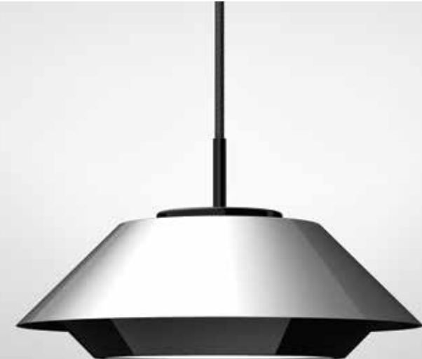
ORCHID 16", 20", 24" or 30"