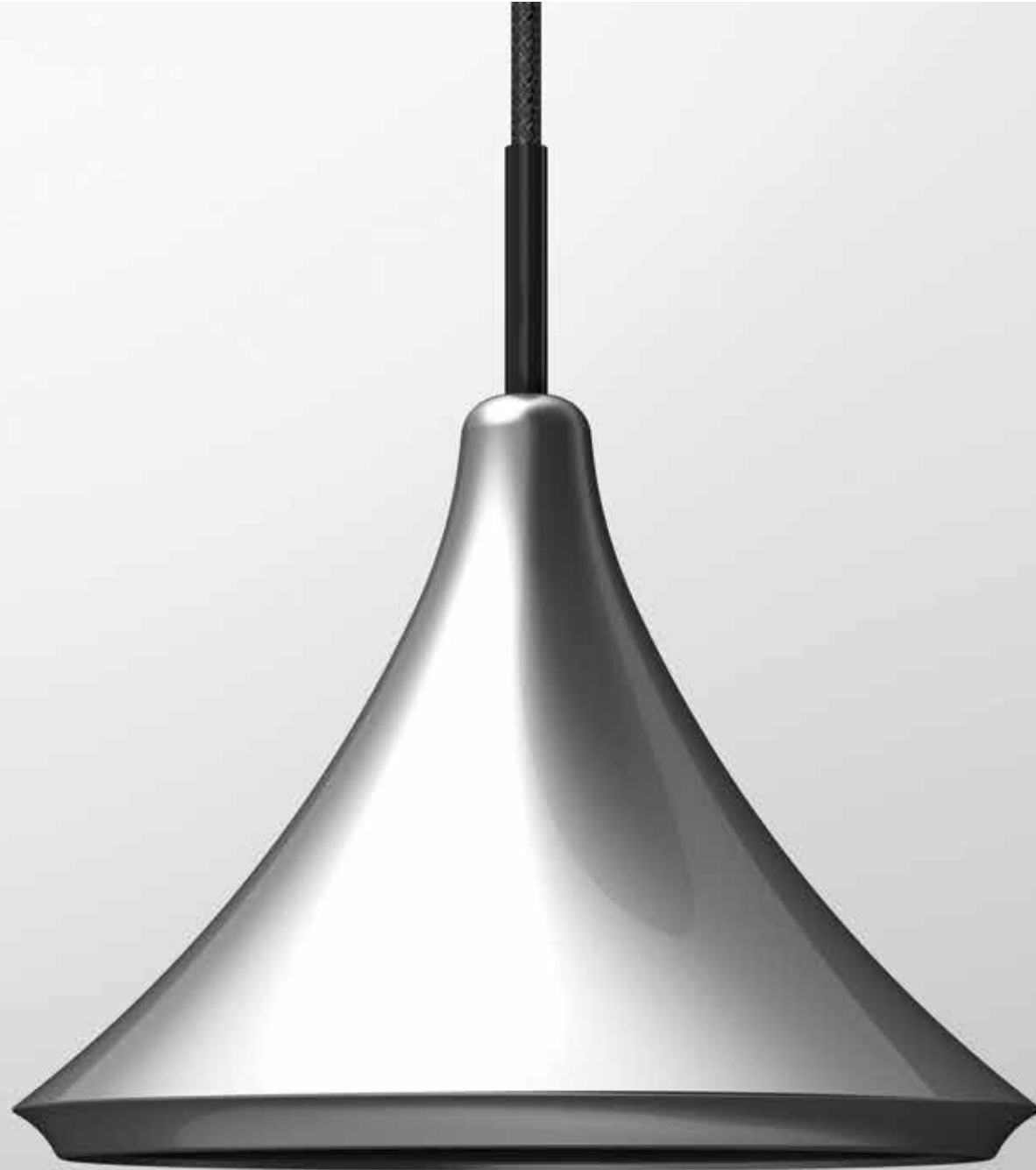
AZALEA 12", 16", 20" or 24"

Pairing design aesthetics with balanced illumination, these versatile pendant luminaires have just the right look and proportion for office spaces, restaurants and bars, hotels, retailers, and campuses.