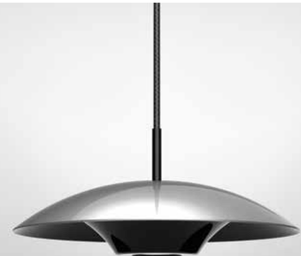
WILLOW 16", 20", 24" or 30"

5 Styles in 4 Sizes | Unlimited Finishes and Combinations | Glare-free Illumination | Low-profile Ceiling Canopy | Made in America