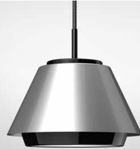
SYCAMORE 12", 16", 20" or 24"