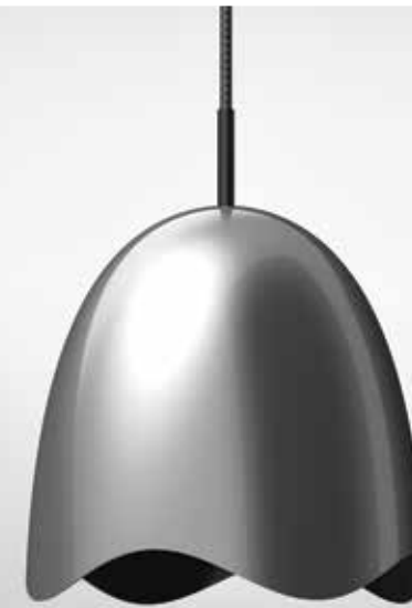
MAGNOLIA 12", 16", 20" or 24"