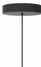
DCCM (12" x 1 1/2") Cord Only