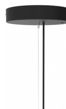
DCCM (12" x 1 1/2") Cable/Cord Only