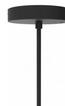
DCCM (12" x 1 1/2")