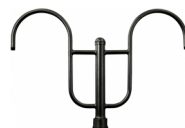
PM40 | 43 3/8" x 28"