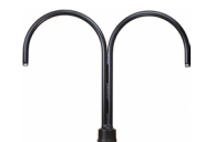
PM20 | 30 1/8" x 25"