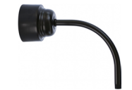
E15 | 16 3/8" x 10 1/2"