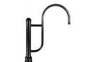
PM30 | 21 5/8" x 28 7/8"