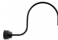
E18 | 30 3/4" x 21 3/8"