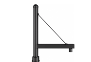
PM319 | 16 5/8" x 27 1/2"