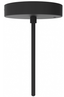
DCCEM (12" OD x 1 1/2" H)

► UP TO 30W MAX ► CL = Clear ► FR = Frosted ► PR = Prismatic ► 100 = Small ► 200 = Large