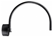
WM54 | 23 3/8" x 18"

Dimensions are Projection x Height Click here for all Wall Mount styles