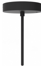
DCCEM (12" x 1 1/2")