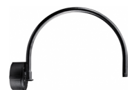
WM54 | 23 3/8" x 18"

Dimensions are Projection x Height Click here for all Wall Mount styles