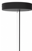
DCCEM (12" x 1 1/2") Cable/Cord Only